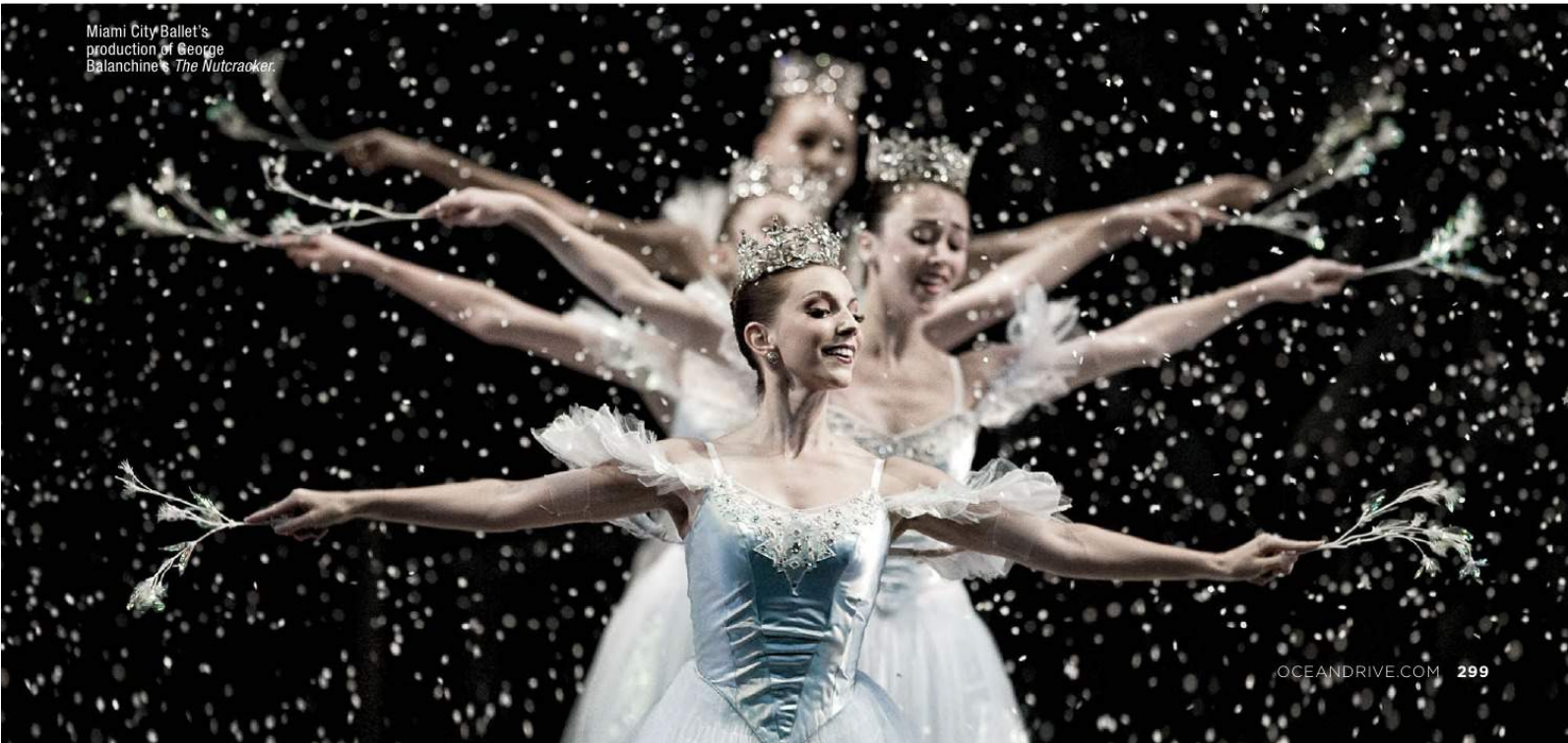
Miami City Ballet's production of George Balanchine's The Nutcracker .

“CHRISTMAS HAS EVOLVED INTO A BEAUTIFUL, ECLECTIC, INTERNATIONAL FOOD-CENTRIC HOLIDAY.”—MICHELLE BERNSTEIN