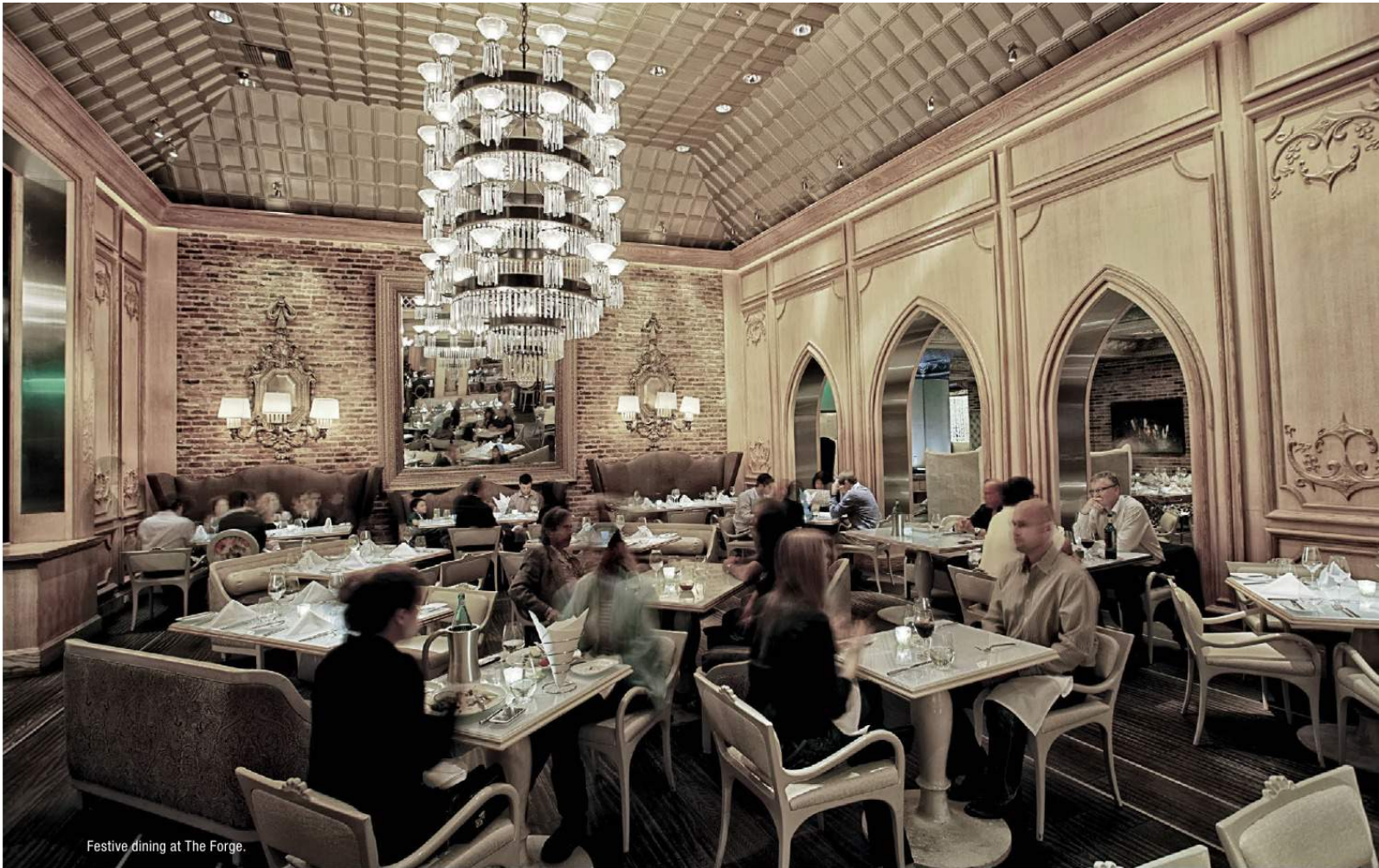
Festive dining at The Forge.

“CHRISTMAS HAS EVOLVED INTO A BEAUTIFUL, ECLECTIC, INTERNATIONAL FOOD-CENTRIC HOLIDAY.”—MICHELLE BERNSTEIN